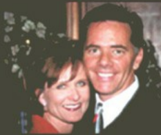
International Church of Las Vegas 8100 Westcliff Dr. Las Vegas, NV 89145 702.242.CARE (2273) www.iclv.com